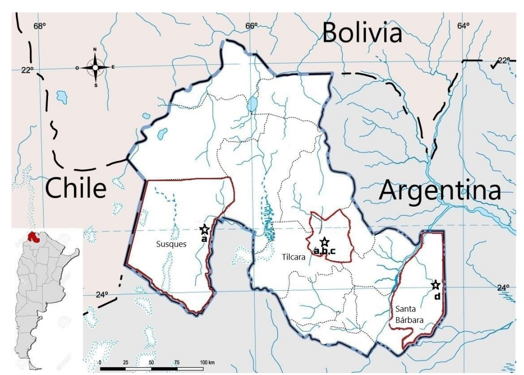
Figure 2 . Sampling sites (stars) at Tilcara, Susques and Santa Bárbara departments where the studied species were collected: (a) T. atacamensis , (b) T. schickendantzii , (c) T. tarijensis , and (d) T. terschekii .

decided to reduce the number of individuals sampled as much as possible. Specimen removal for this experiment was approved by the Environment Ministry of Jujuy Province (Res. Nº 106/2015-DPB, Nº 044/2016-S-B and Nº091/2017-S-B). Samples were transported refrigerated to the laboratory where spines were removed. Fresh material was used to establish pH and then totally dehydrated (using a lyophilizer AdVantage Pro Freeze Dryer de SP Scientifics) and ground to dust, the dry material was preserved without moisture or sun exposure until use.